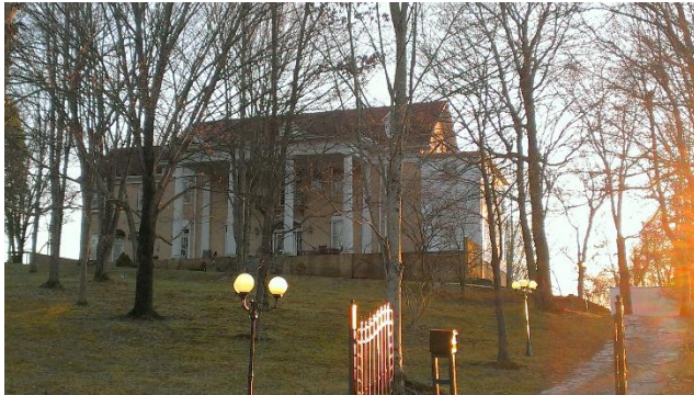
Figure 3 Fairmount Estate

We are only on Pennsylvania for a short time when we turn onto Taylor St. and enter the historic Fairmount Neighborhood. Did we mention hills? You didn't think we were past the hills did you? Taylor has an uphill just before we turn onto beautiful Maryland Ave. The Fairmount neighborhood also has lots of historic homes built in the late 1800s and early 1900s. The house on the corner of Taylor and Maryland has a ballroom on the 3 rd floor. Anyone up for dancing? Once on Maryland we enjoy a downhill...much earned after the climb on Taylor. We are going to "zig-zag" through Fairmount in order to 1. Avoid some major hills, and 2. Check out some of Bristol's most historic homes.