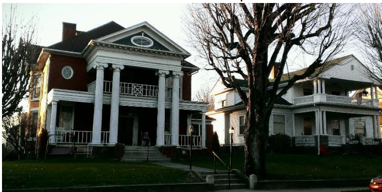
Figure 1 Fort Shelby Manor