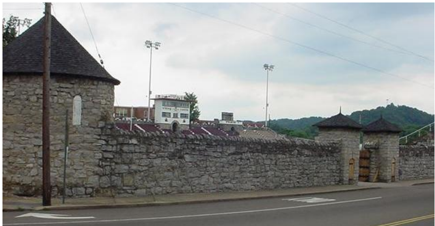
Figure 4 Stone Castle, Tennessee High School

Once on Edgemont we notice Tennessee High School and Stone Castle is on our right, which as we all know is the finish line. On race day we'll hear music playing, and want to detour, but we still have about 1.5 miles to go. We make a left onto Courtland (oh Stone Castle you were so close!), and then right onto Tremont and the castle disappears behind us. Tremont is a great rolling mostly downhill stretch. We see mile 12 and know we've almost made it. We now make a right on Duncan, cross over Edgemont, make a right