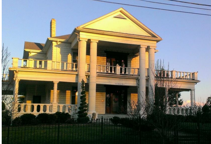
Figure 2 Tootsie Roll House

We turn onto Holston Avenue, and we are wide-eyed as this street has some of the most stately homes in Bristol. These homes were also built in the late 1800's and early 1900's by some notable Bristol residents. We notice the "tootsie roll" house on the left as we start up Holston... makes me want a tootsie roll! This house got its nickname because of the unique exterior. Holston Avenue is like a ribbon, rolling up and down, but the homes are so majestic we hardly notice the change in elevation. Then we cut over on 7 th , but wait this isn't the first time we'll be on 7 th , at least not this 7 th . One thing we've learned about Bristol is that street names seem to repeat themselves in different areas of the city, or streets will magically change names. That's part of being in an older city, I guess, but I digress... 7 th is a new addition to the Bristol Half & Half course and our first time running on this street. It also has some lovely old homes and is a very nice flat to rolling section of the course. Before we know it we are back on Holston getting ready to make our way to downtown Bristol.